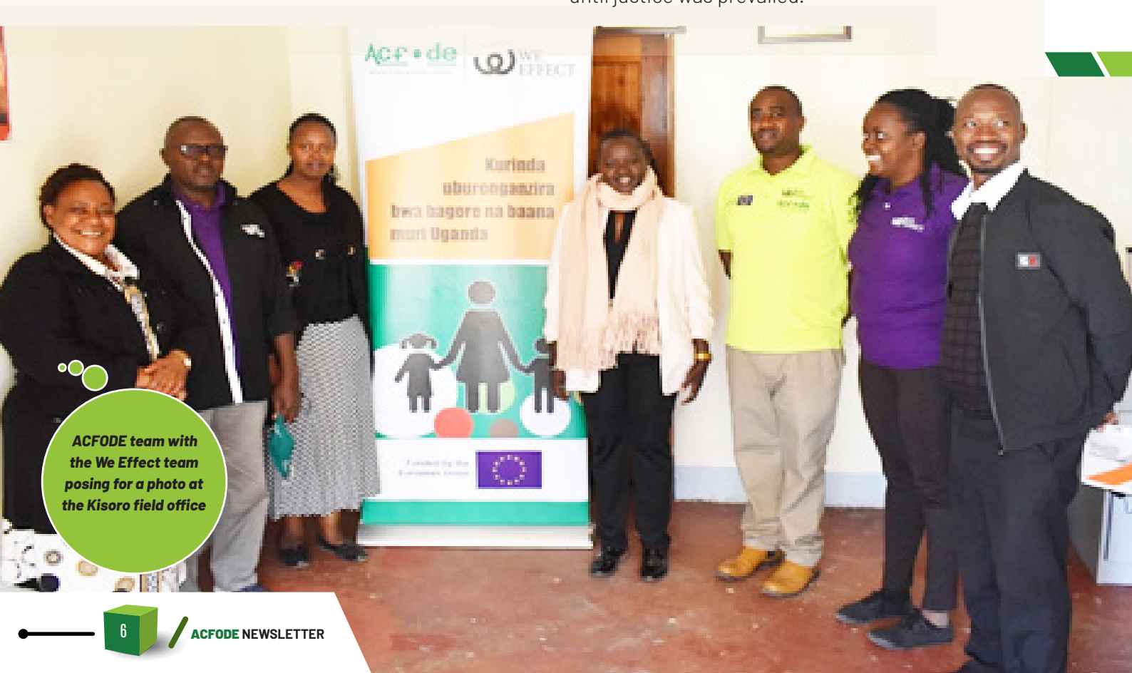
ACFODE team with the We Effect team posing for a photo at the Kisoro field office