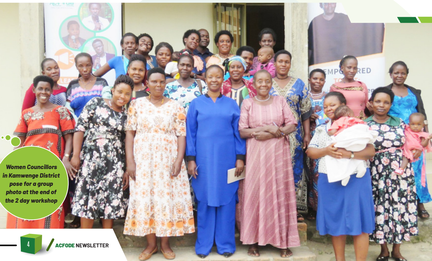
Women Councillors in Kamwenge District pose for a group photo at the end of the 2 day workshop

ACFODE will continue working with and supporting the caucuses to hold regular reflection meetings and to sharpen their communication, monitoring & evaluation, documentation and reporting skills further.