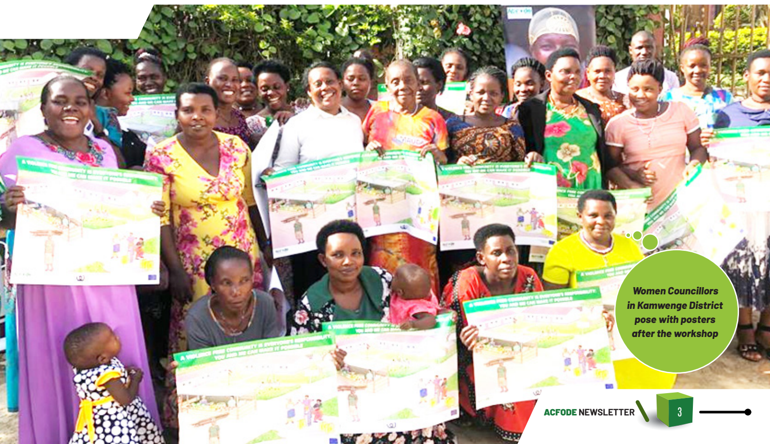
Women Councillors in Kamwenge District pose with posters after the workshop

She is now able to mobilize her colleagues to take on challenges while also engaging in income-generating activities like making crafts, weaving mats and baskets, which enables them to earn their own money rather than relying on hand-outs. Even though they are yet to find sufficient market for their products, they believe this is a more sustainable way to go about their lives".