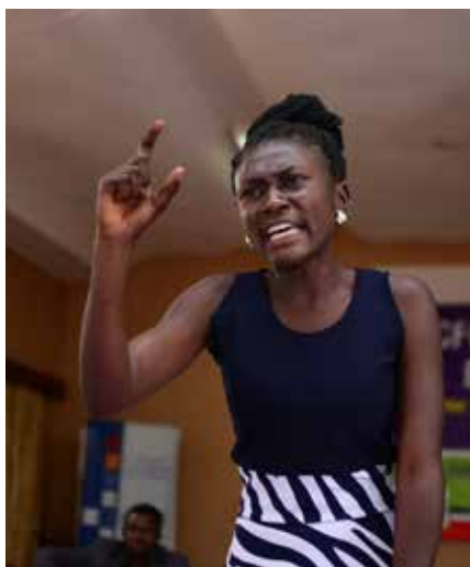
Pg 17. CHAPTER TWO DRAWING THE YOUTH INTO THE ACTION