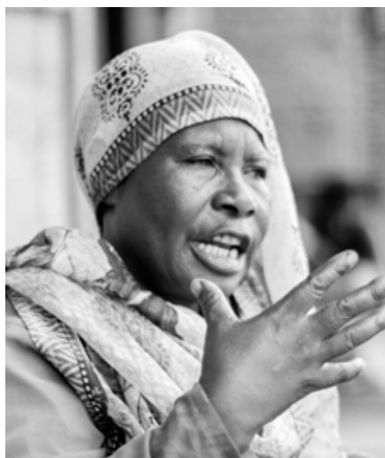
Pg 9. CHAPTER ONE EMPOWERING WOMEN TO REALISE THEIR ECONOMIC & POLITICAL ASPIRATIONS