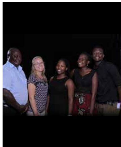
Pg 21 CHAPTER THREE TRANSFORMED TO TRANSFORM THE WORLD: KAS/ACFODE STAFF AND MEMBERS SPEAK OUT