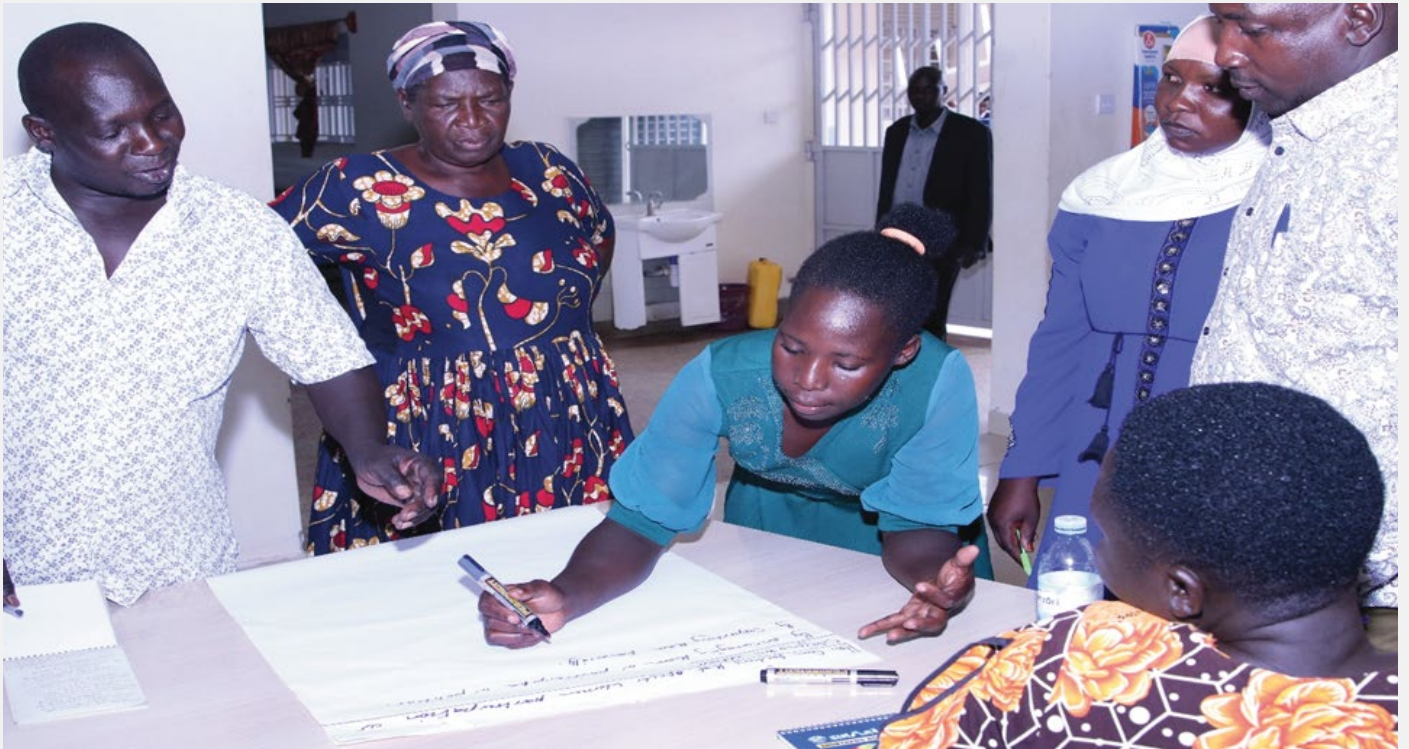
Participants in a group discussion during the T.O.T training in Kaberamaido.

Leadership development: ACFODE trains women and female youth in political participation.