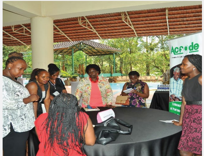
Participants discussing a given task during the knowledge café session