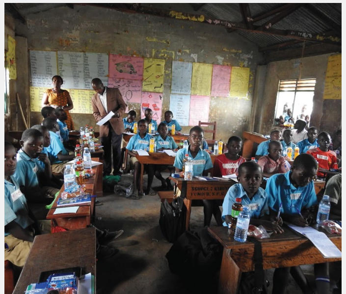
A group photo of participants during the project monitoring visit by ACFODE

Following the capacity building session, 4 Gender Based Violence prevention clubs were formed to spearhead the spread of information among fellow age mates in the school community as well as their home areas.