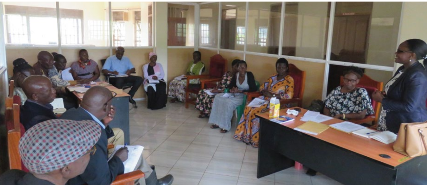
ACFODE team addresses leaders of BIACE in Jinja