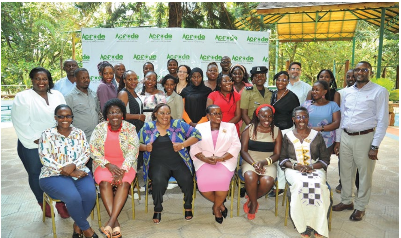
A group photo taken by participants and ACFODE officers at the knowledge café in Kampala.

"I would like to sincerely thank Care International in Uganda for their collaboration and support through the East African Learning Collaborative. With their assistance, we secured a small grant that enabled us to