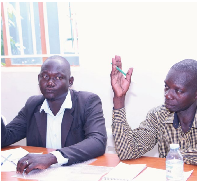
Participants in a group discussion during the T.O.T training in Kaberamaido.

The project was implemented in areas of South Western Uganda in the Districts of Kyegegwa, Kaberamaido and Amolatar.