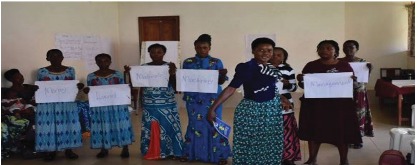
Participants in a group discussion during the T.O.T training in Kaberamaido.

ACFODE remains dedicated to its vision of a just society where gender equality is a reality. This initiative signifies a significant step toward achieving this vision, as women in Kasese are now poised to embark on a journey of economic empowerment, turning their entrepreneurial dreams into tangible, sustainable realities.