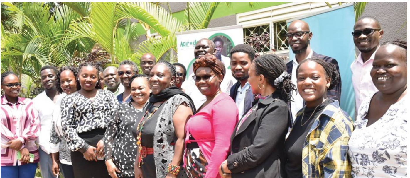
Acfode Staff And Members Pose For A Group Photo After Attending The Legal Training.

ACFODE has held past trainings with staff and CSO’s on understanding concepts in its line of service and adhering to legal commitments. Moving forward from the training AFCODE is devoted to do as taught by acquiring certificates , timely renewing of its permit and keeping clean accounts among others.