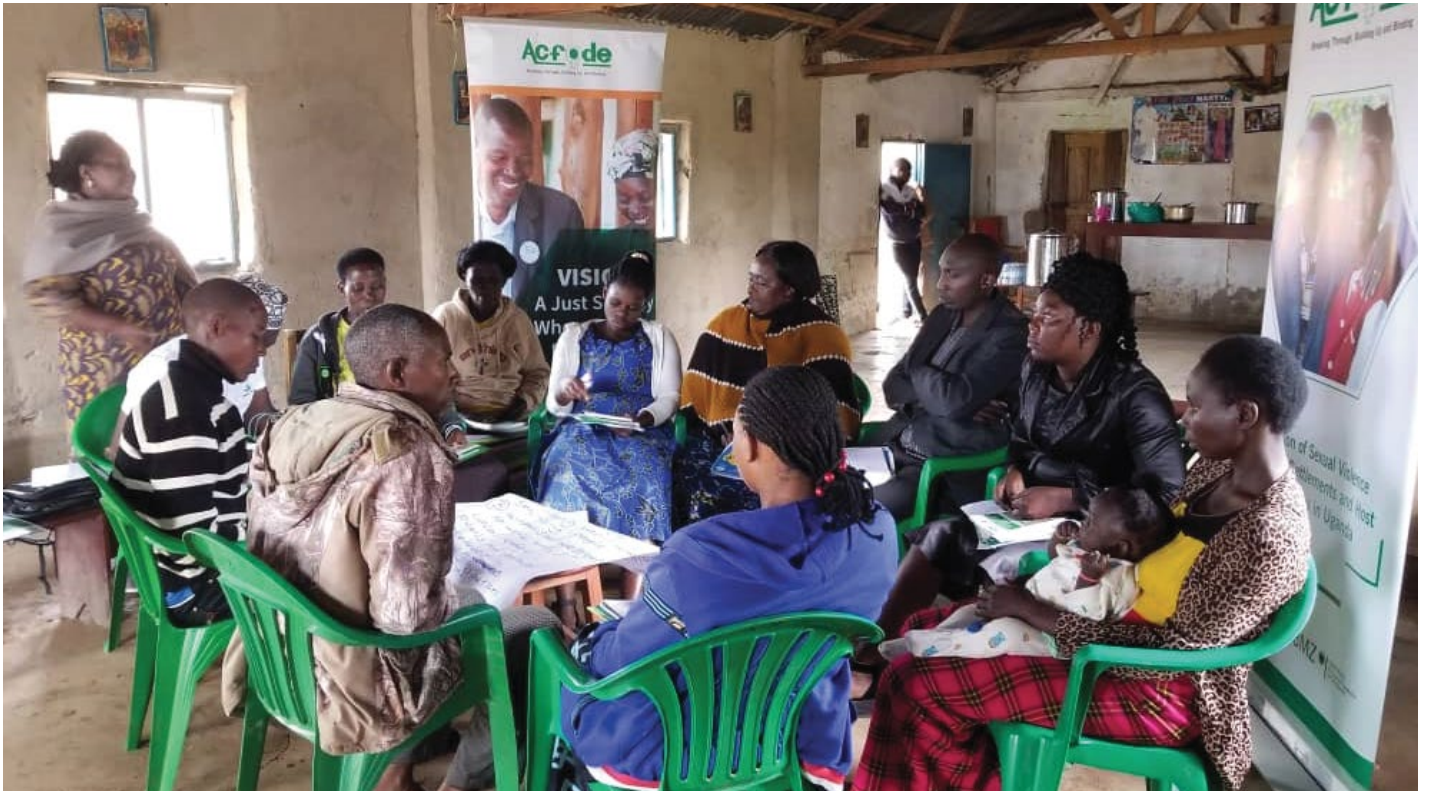
During Session 2 on the PME Model, the facilitator engages with community facilitators

Armed with the Participatory Monitoring Evaluation (PME) model and unwavering support, the facilitators eagerly embraced their mission. “We are ready to navigate the complexities of policy advocacy and engage with key stakeholders,” expressed one facilitator. “Our voices will be heard, our actions will inspire, and we will tirelessly work to uplift the marginalized and vulnerable,” added another.