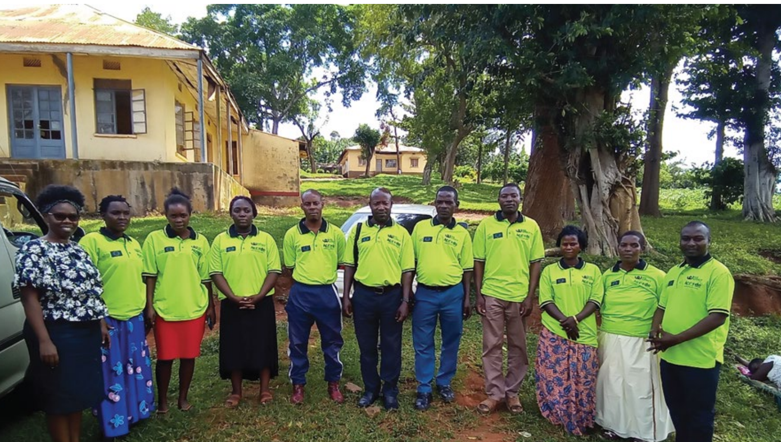
A group photo of participants during the project monitoring visit by ACFODE

According to the findings by the monitoring team, several achievements were made by ACFODE. The duty bearers Built the capacity of 30 Grassroots local organizations to advocate for women's and children's rights.