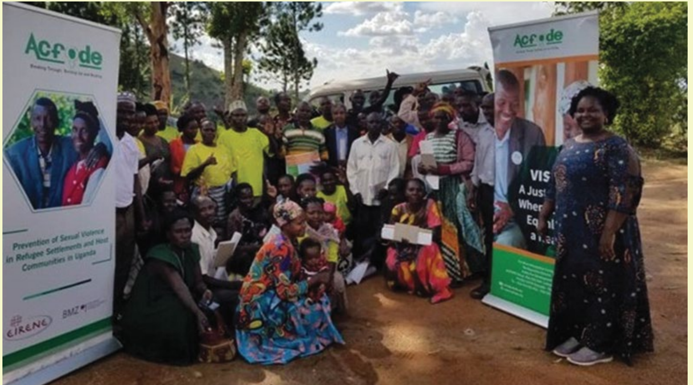
Model couples and social actors pose for a photo after the 2-day mentorship session at Kyakatwanga Catholic Church in Kyegegwa Sub County.

In a trailblazing collaboration, ACFODE and EIRENE e.V., fueled by the unwavering support of The Federal Ministry for Economic Cooperation & Development, orchestrated an extraordinary two-day mentorship session. Within the enchanting confines of Kyakatwanga village, model couples and social actors united, igniting a powerful movement to construct a sanctuary devoid of sexual and gender-based violence (SGBV). This enthralling gathering set the stage for an awe-inspiring transformation, arming these remarkable individuals with the wisdom and capabilities needed to etch an indelible mark upon their beloved community.