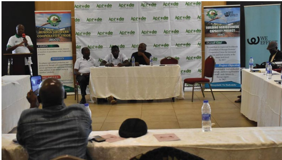
Panelist sharing views during the world food day celebrations hosted by ACFODE and its partners in Jinja.

In a vibrant celebration on October 25, 2023, Action for Development (ACFODE) and its partners convened at the Source of the Nile Hotel in Jinja to mark World Food Day. This global event, observed on October 16 each year, focuses on achieving zero hunger, aligning with the United Nations' Sustainable Development Goal No. 2.