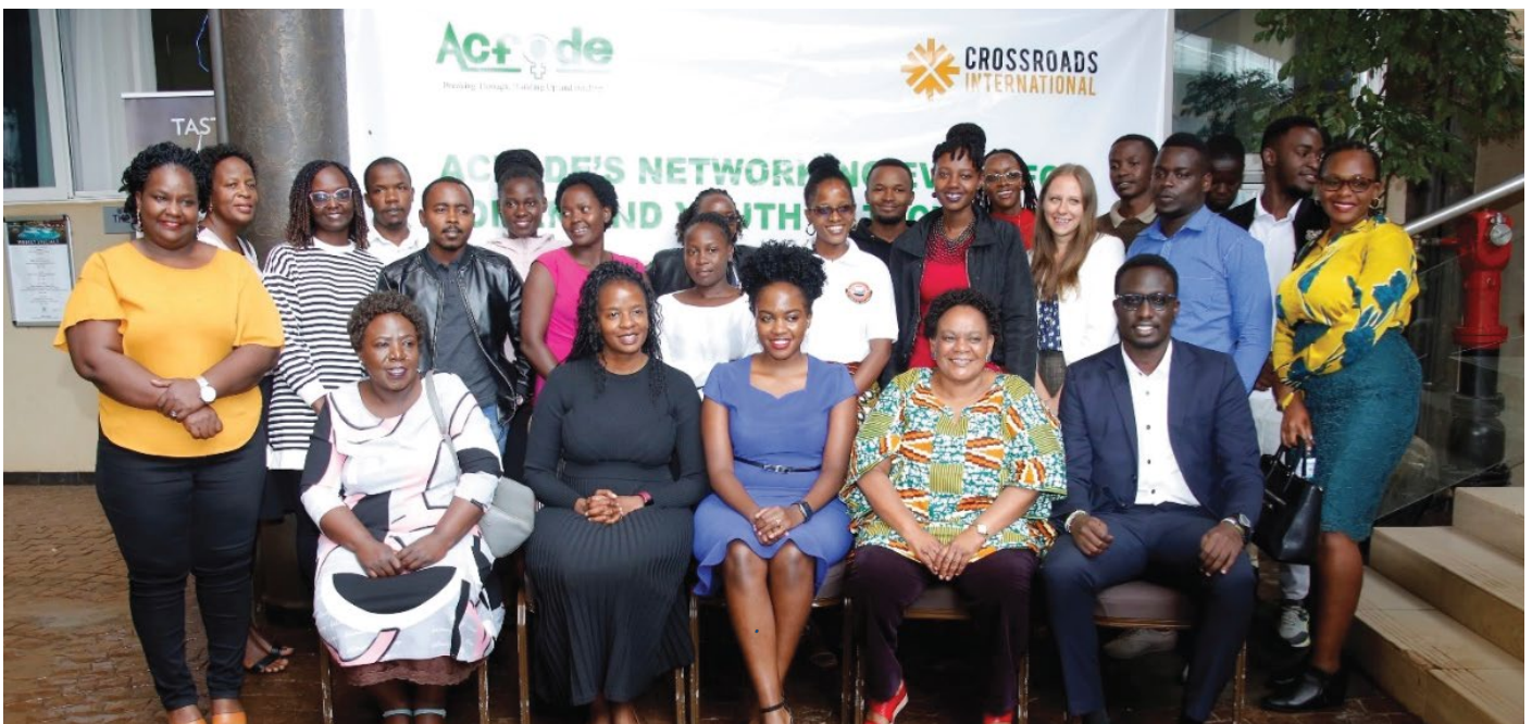
A group photo of panelists ,participants and organizers of ACFODE's networking event for Women and youth in technology at Skyz Hotel in Kampala.

The ACFODE networking event, in collaboration with Crossroads International, highlighted the transformative potential of digital innovation and technology for gender equality. By addressing challenges and promoting inclusion, women can shape a future where technology empowers and advances their rights, fostering an equitable society.