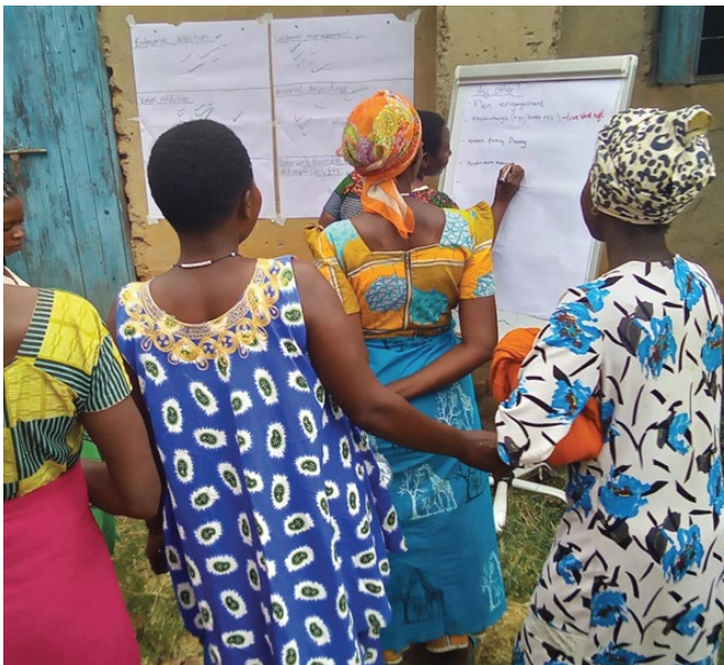
Members of the Mt. Rwenzori Coffee farmers' cooperative Union participating in the training conducted by ACFODE in Kasese.

In our recently concluded Social & Economic Needs Assessment, women in this area were found to encounter several impediments to their socio-economic participation in the development process undermining their positive contribution to their communities.